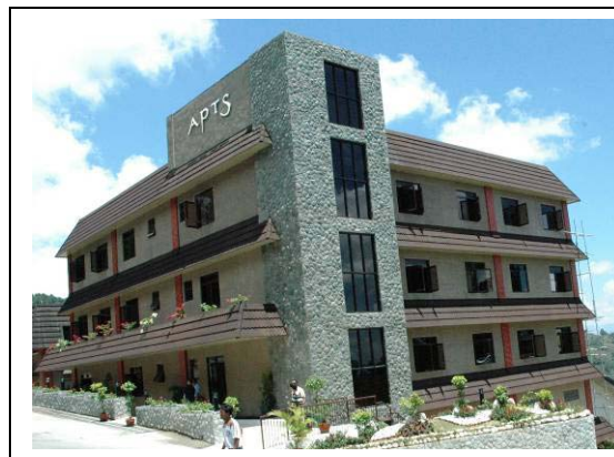
The “Miracle” Academic Research Center