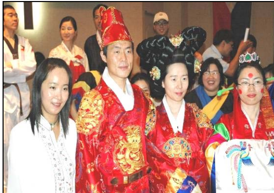
Students from China and Korea

Continue to pray for students from 20 nations studying at APTS this school year. They need strength and resources as they train to change the future of their nations. This is truly "Change you can believe in!"