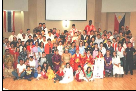
APTS community in national dress